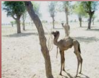
A camel calf that lost its mother during milking in Boset, 2005