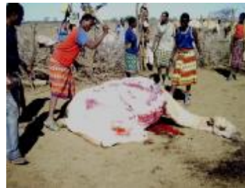
Dead camel slaughtered for examination