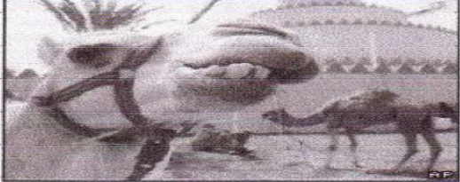
Camel's milk is thought of as nectar in many Arab countries

The United Nations is calling for the milk, which is rich in vitamins B and C and has 10 times more iron than cow's milk, to be sold to the West.