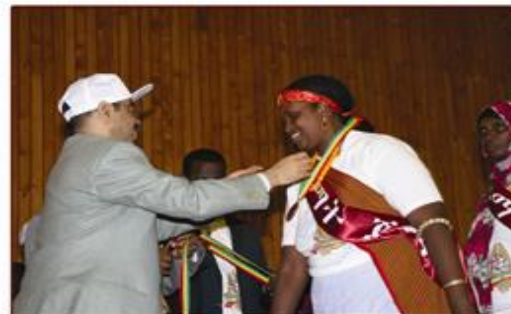
Fig. 3. H.E Ato Meles Zenawi Awarding development hero Pastoralist