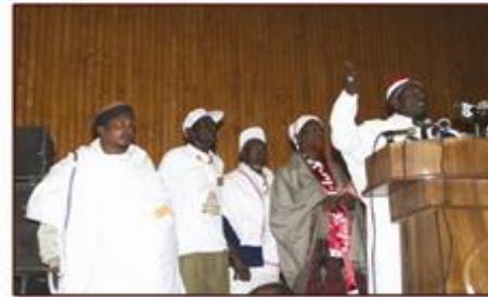
Fig. 2. Pastoral elders passionately blessing the ceremony and passing key messages