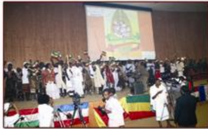
Fig. 1. Celebrating solidarity and unity in diversity (10 th EPD)